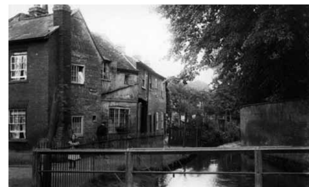
Duck Alley